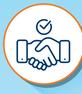
Hiring and retention