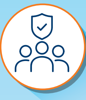
Security and governance